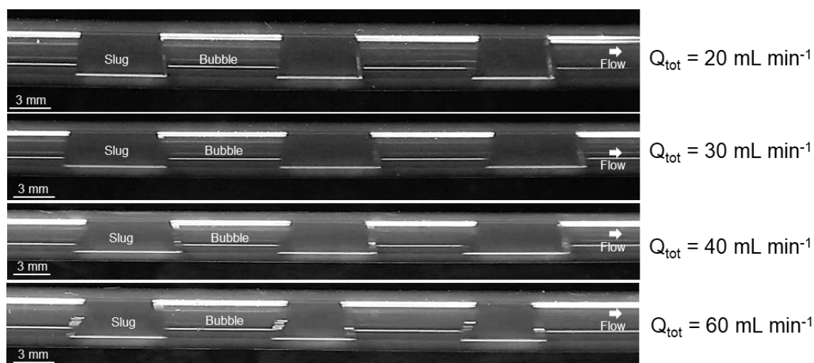
Figure S1. Images of aqueous saturated Met/H 2 O slugs at the end of tubing ( L_{tubing} = 7.5 m) for different total volume flow rates Q_{tot} . The experiments were conducted at ambient temperature ( \vartheta_{amb} \approx 20 °C).

Anne Cathrine Kufner, Sarina Zink and Kerstin Wohlgemuth *